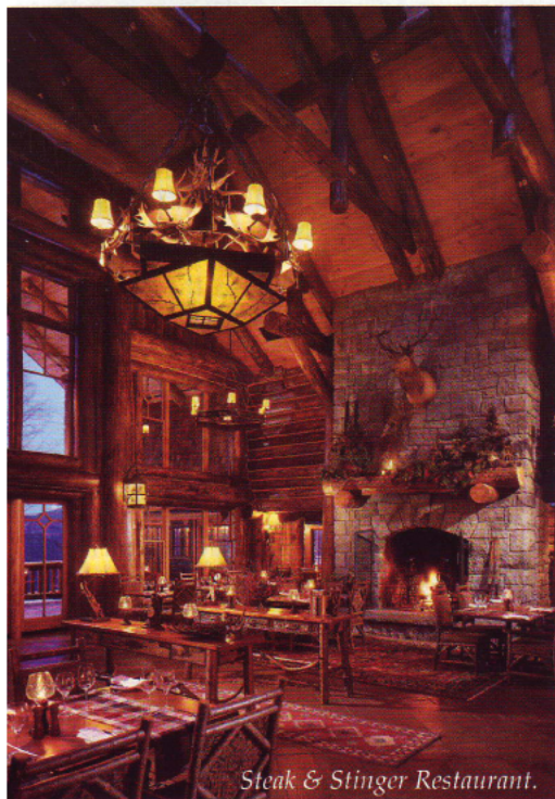
Steak & Stinger Restaurant.

For a change of pace, take a walk around scenic Mirror Lake and stop for a lite bite or a drink at the Cottage , a charming waterfront pub overlooking the lake.